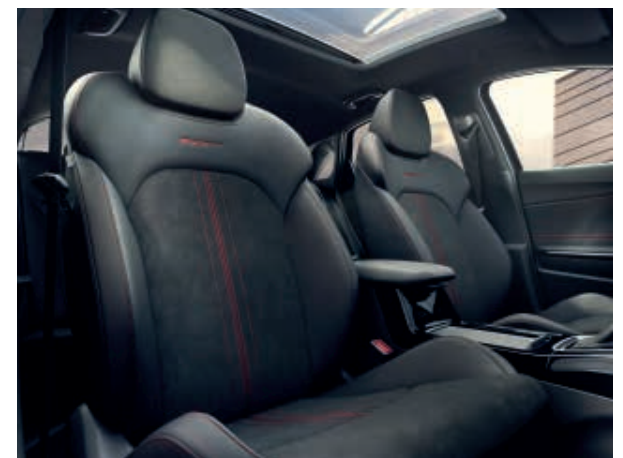
Black Leather and Faux Suede Seats with Red Stitching