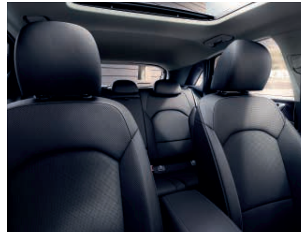
Black Cloth Seat Trim with Black Faux Leather Bolsters

Independent. Progressive. Inspirational. Confident. Four words that are always on the Kia agenda for our cars. Especially inside. With a range of stylish interior options, carefully selected materials and bold trims, you'll want to get behind the wheel instantly.