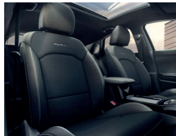
Black Cloth and Light Grey Faux Leather Seats