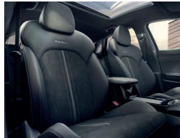
Black Cloth and Light Grey Faux Leather Seats