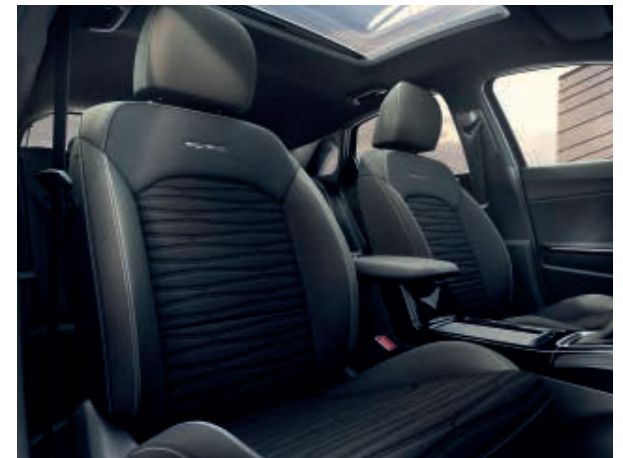
Black Cloth and Light Grey Faux Leather Seats